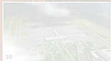
10 Current Projects & Developments New Terminal at Oslo Airport

UNITECHNIK ICM FZCO arose from the firm of ICM Airport Technics FZCO that has been present in Dubai for a number of years. Since October of 2008 UNITECHNIK ICM FZCO has its headquarters at Dubai Airport Freezone (DAFZ) and functions as the local representative of the two German firms of Unitechnik AG and ICM Airport Technics GmbH. UNITECHNIK ICM FZCO has 10 employees in Dubai. The firm carries out the following services: Sales and consultancy; Project and site management; Installation; and Service and maintenance.