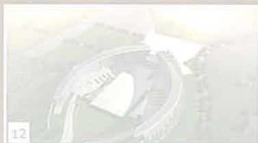
12 Exclusive Interview Tiger Profiles & Insulation