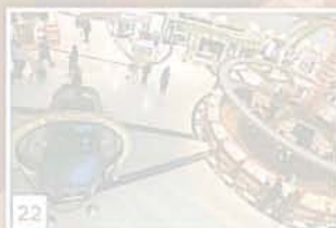
22 Airport Retail Latest Updates on the Sector