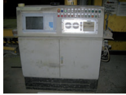
Old control unit for the plotter