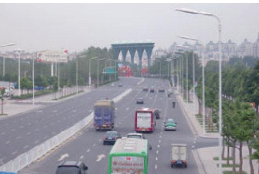
Hefei: generously designed roads connect the periphery with the centre