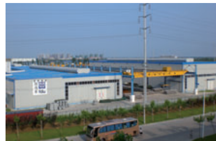
fdi precast plant in Hefei, China

compartments are bricked up, the ceilings shuttered and casted with in-situ concrete. The use of machines is for the most part dispensed with. The workforce is inexpensive and easy to acquire. The disadvantage of this method of building is the construction time required. It currently requires approx. 18 months to complete a new residential complex. This is exactly the point at which Sievert comes in with its precast plant. Prefabricated concrete parts can reduce building time to 12 months. And that with considerably improved quality.