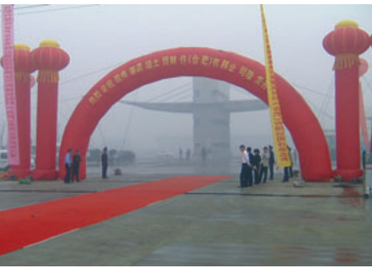
Ceremonial opening of the precast plant in Hefei

The Sievert building materials group, with its head office in Osnabruck, Lower Saxony,