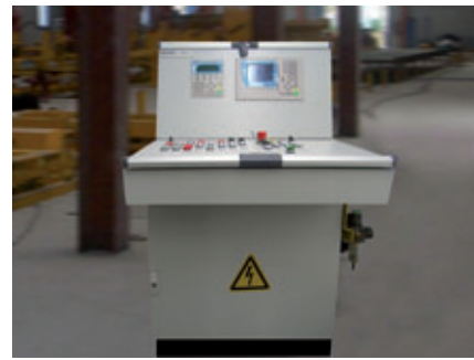
New control unit for the plotter with modern Siemens components