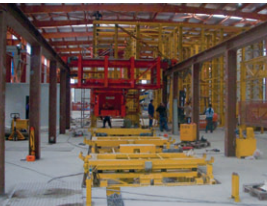
Freshly painted, the plant parts from Coswig are reassembled

entered into two joint venture contracts in November, 2006 with the Hefei-based Haiheng Group. This resulted in the formation of the Sievert quick-Mix Building Materials Co. Ltd. and Sievert Concrete Precast Elements Co. Ltd. companies. Sievert holds 66.7% of the shares in both companies. The joint venture partner, the Haiheng Group, is an important project development company that manages apartments and commercial real estate.