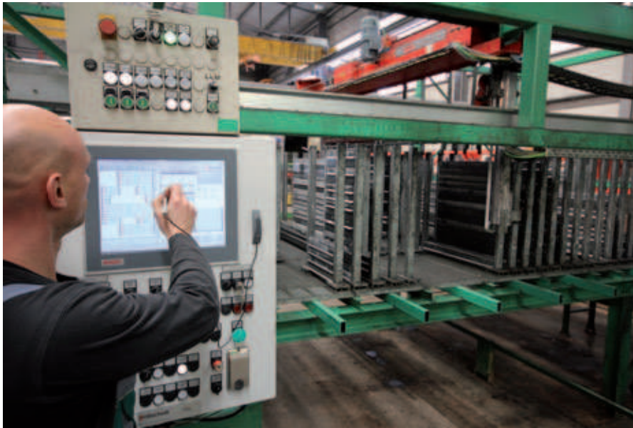
Beckhoff control unit for the auto-storage machine and formwork robot

Unitechnik – Your Partner for retrofit, extension and new invest