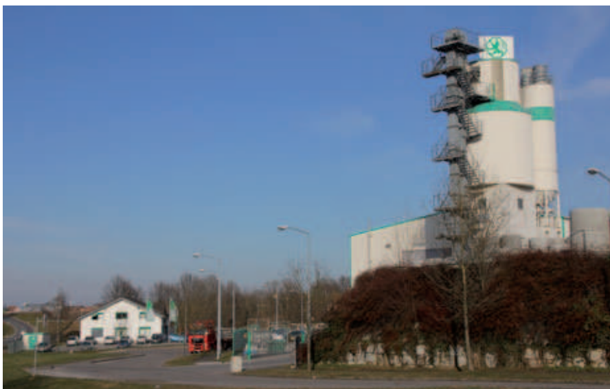
Penig production facilities of Heidelberger Betonelemente GmbH & Co. KG