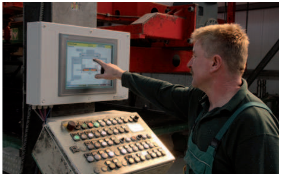
The touchscreen terminal was very well received by employees

The compact circulation system is composed of a Weckenmann formwork robot with plotter function, which is fed with formwork by an automated part storage machine. The work is carried out with magnets and superimposed formwork. Reinforcement rods and lattice girders are set in place automatically. Straightening and cutting machines plus reinforcement robots from Filzmoser are in operation. The concrete spreader, vibration station and turning device all originate with Avermann, as does the curing chamber with its 61 slots. For hoisting, 4 locations are available, one of which is set up as a tilting table. The system is equipped with 70 pallets (10.5m x 3m). A DOS based ULB computer from Unitechnik is in operation as master computer.