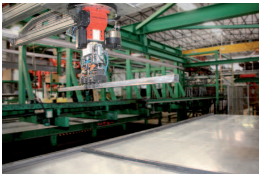
Formwork robot with more dynamism

A 4 week interruption in production had been calculated for the conversion measures needed. At the beginning of February 2011, the contractors began work. Besides Unitechnik, this meant Filzmoser for the reinforcing technology. Control technology components were delivered preconfigured